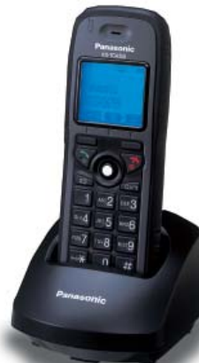
KX-TCA364 Tough Type Model

Colour LCD Display *1 Illuminated Keypad Multiple Language Display Speakerphone Programmable Soft Keys*2 PBX functionality support 200 Entry Phonebook Headset Compatible 10 Ringer Melodies *1 10 Programmable Hot Key Dialling Vibrate Alert*3 Meeting Mode*3 IP64 Dust and Splash resistant*4