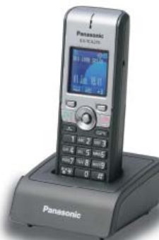
KX-TCA275 Compact Business Model