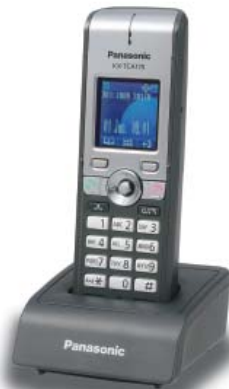
KX-TCA175 Standard Model