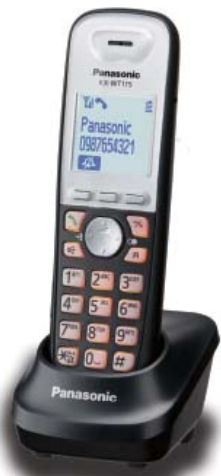
KX-WT115 Entry Level Model