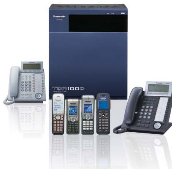
KX-TDA100D PRODUCT LINE UP

The KX-TDA100D PBX is a business platform your business can grow with. The system comes ready for use with extensive PSTN Phones, PSTN Trunks, IP Trunks, IP Phones, IP based CTI, and a whole family of business communication applications.