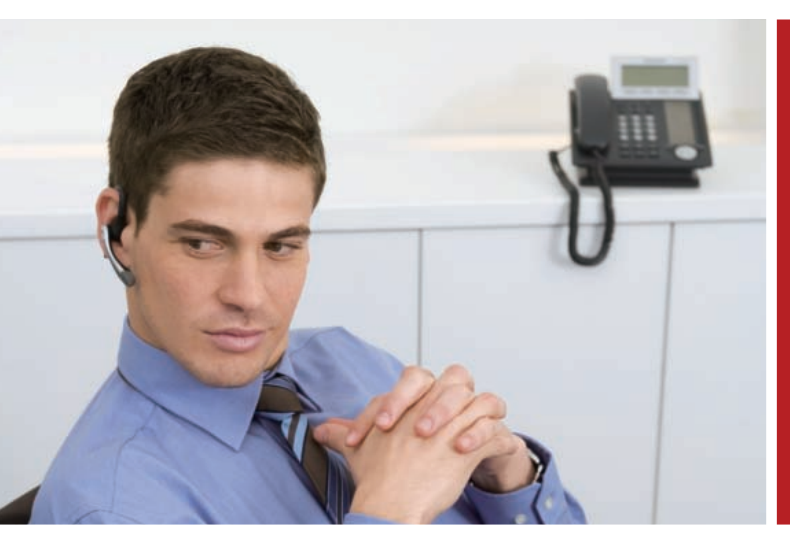
IP-Proprietary Telephones KX-NT300 Series

Panasonic introduces new IP telephone series that are stylish, intuitive, user friendly and follow universal design philosophy making them highly appealing, easy and comfortable to use by all system telephone users.