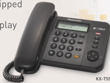
KX-TS580EX1 / EX2 Black

RoHS-specified No Chemical Used substances Lead, cadmium, mercury, hexavalent chromium and specified brominated flame retardants (PBB and PBDE).